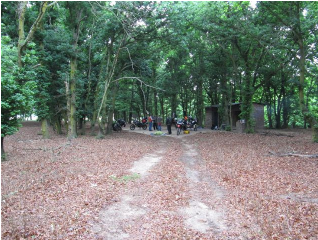
Chrissies Camp Site with basic but adequate ablutions.