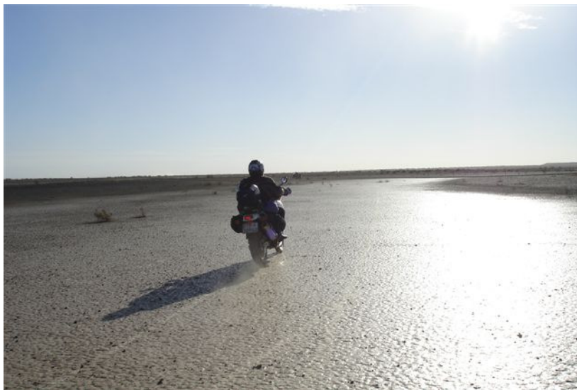
Verneuk Pan. (Salt Pans)